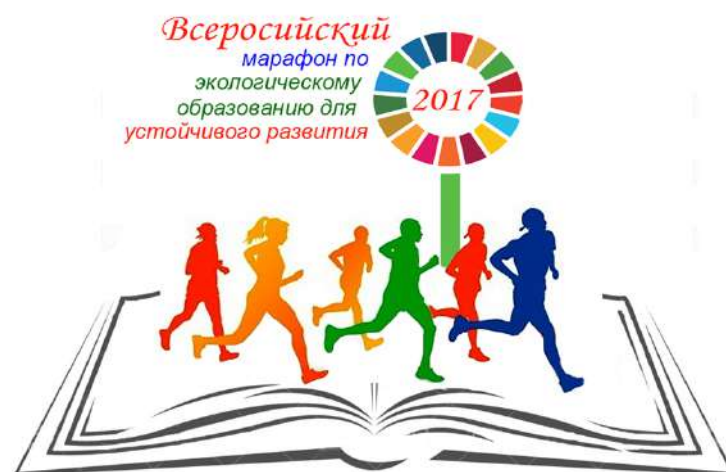
The logo of the marathon