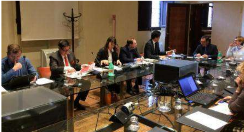
The delegation of the Faculty of Global Processes and the UNESCO Chair at the conference on rankings in the University of Bologna

In the reporting period the Chair continued to develop joint research and education projects with other chairs and universities. In November, 2016 the problem of the university rankings was the subject of the discussion with the Bologna University. A joint research project on rankings was established.