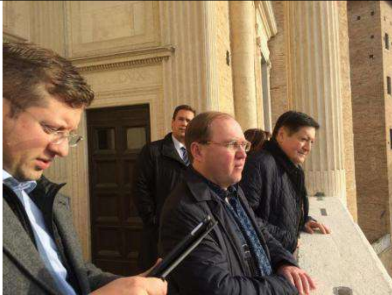
The delegation of the Faculty of Global Processes and the UNESCO Chair in Urbino.

During the visit of the delegation of the Link University its member, President of the Italian Society for International Organizations former Minister of Foreign Affairs of Italy Dr. Franco Frattini gave in the framework of the Day of Science on October 8, 2016 at the Moscow University a public lecture on contemporary international relations. The lecture organized by the Faculty and the Chair was highly appreciated by about 800 students and professors who attended the lecture.