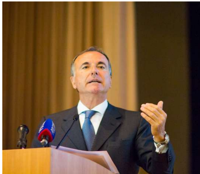
Prof. Frattini at his lecture in the Lomonosov Moscow State University on the Day of Science.

During the visit of the delegation of the Link University its member, President of the Italian Society for International Organizations former Minister of Foreign Affairs of Italy Dr. Franco Frattini gave in the framework of the Day of Science on October 8, 2016 at the Moscow University a public lecture on contemporary international relations. The lecture organized by the Faculty and the Chair was highly appreciated by about 800 students and professors who attended the lecture.