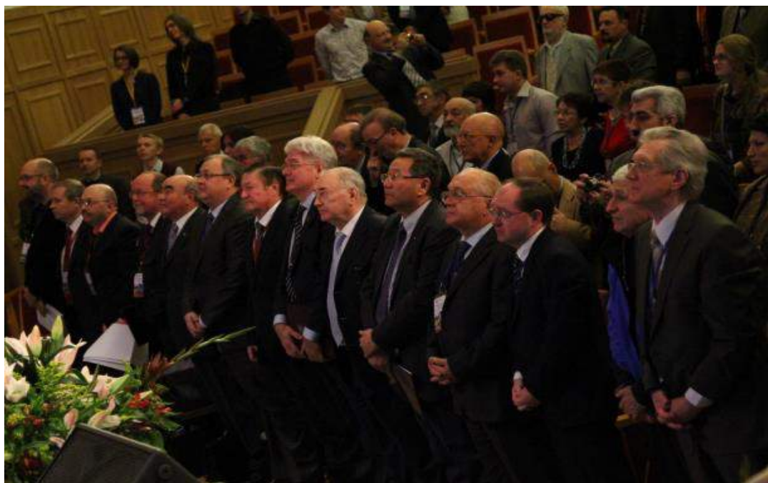
Scientists at the congress "Global Studies 2013"