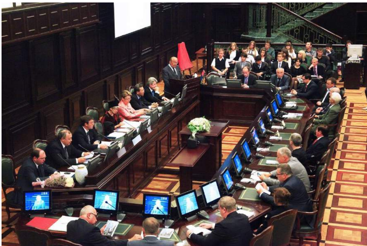
UNESCO Director-General Irina Bokova at the meeting of the Academic Council of the Lomonosov Moscow State University.

The inclusion of the UNESCO Chair into the University structure opens a very important possibility to use for the Chair's activities the educational and scientific research state licenses and permissions issued to the University, as well as its exceptional status of the flagship of the Russian higher education according to the Federal Law from November 10, 2009 № 259 "On Lomonosov Moscow State University and St. Petersburg State University".