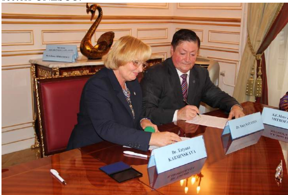
Signing the agreement on the establishment of section in Ugra State University.