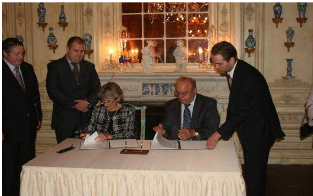
Signing of the Agreement on the creation of the UNESCO Chair on September 28, 2010

The Chair was fully prepared and started operating immediately with the acting Chairholder who was later approved by UNESCO and appointed in this capacity by the Order of the MSU Rector.