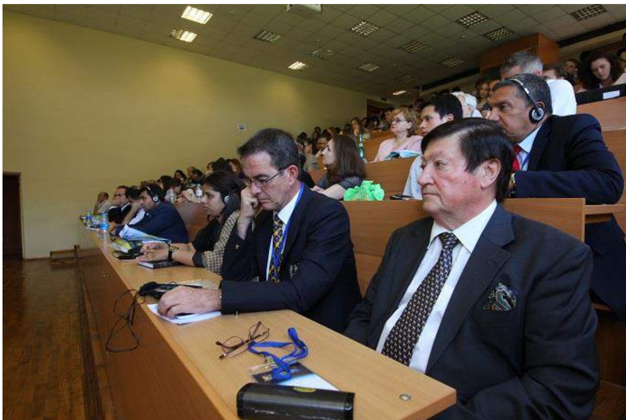
The Participants of the Moscow Summit "New Global Challenges"

An important part of the summit was the discussion the main activities of the International Academy of Global Studies, initiated with the participation of the Chair. Guests also participated in the debate on the theme "The role of Russia in the global summits."