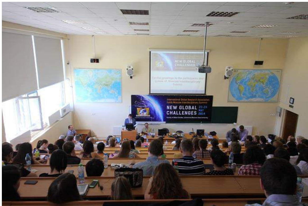
Moscow Summit "New Global Challenges"