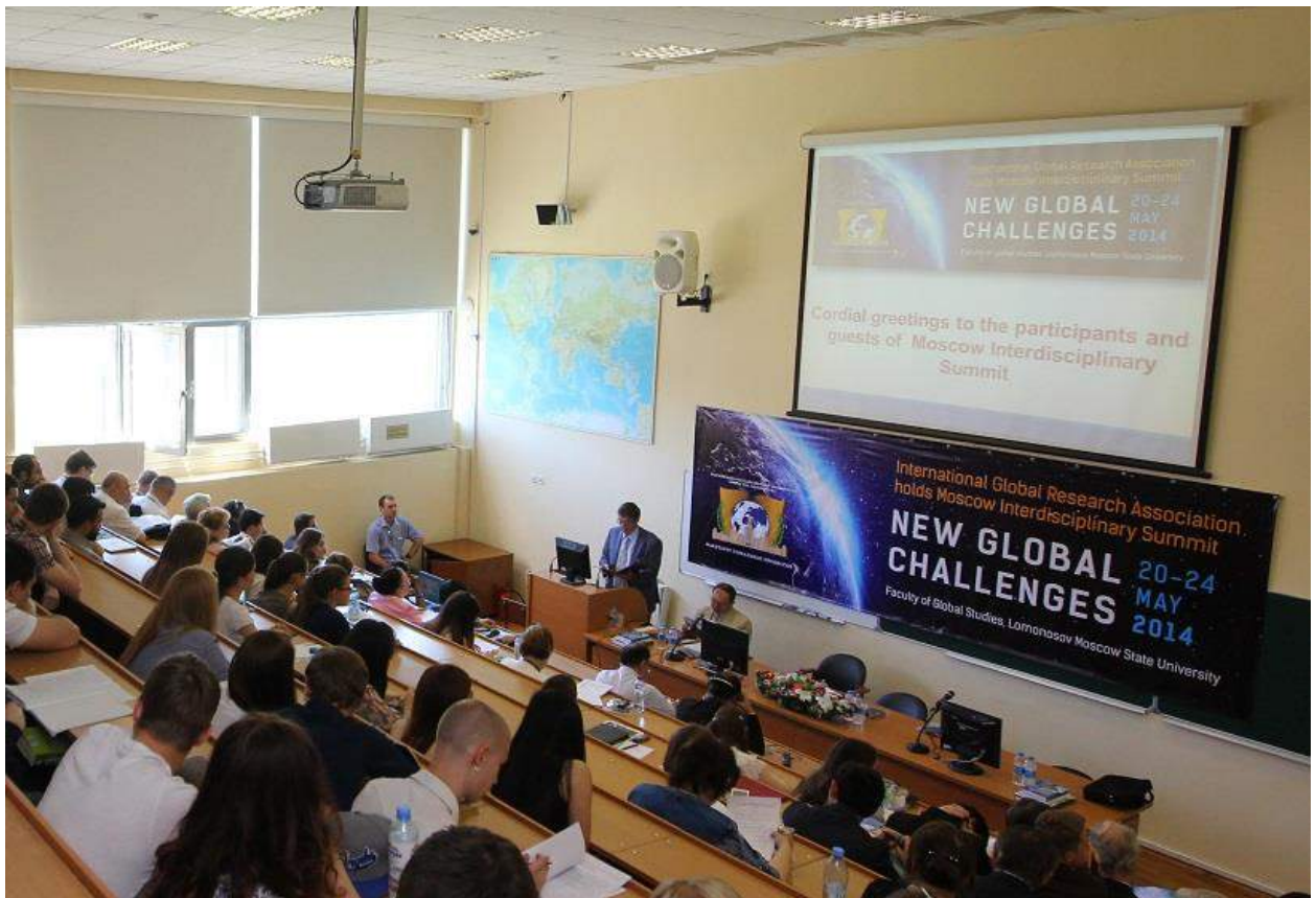
Moscow Summit "New Global Challenges"

During the period of international instability and under the sanctions against Russia the summit demonstrated the strength of international scientific relations of faculty, the university and the Chair, openness to dialogue and the great interest of foreign colleagues to the Russian point of view.