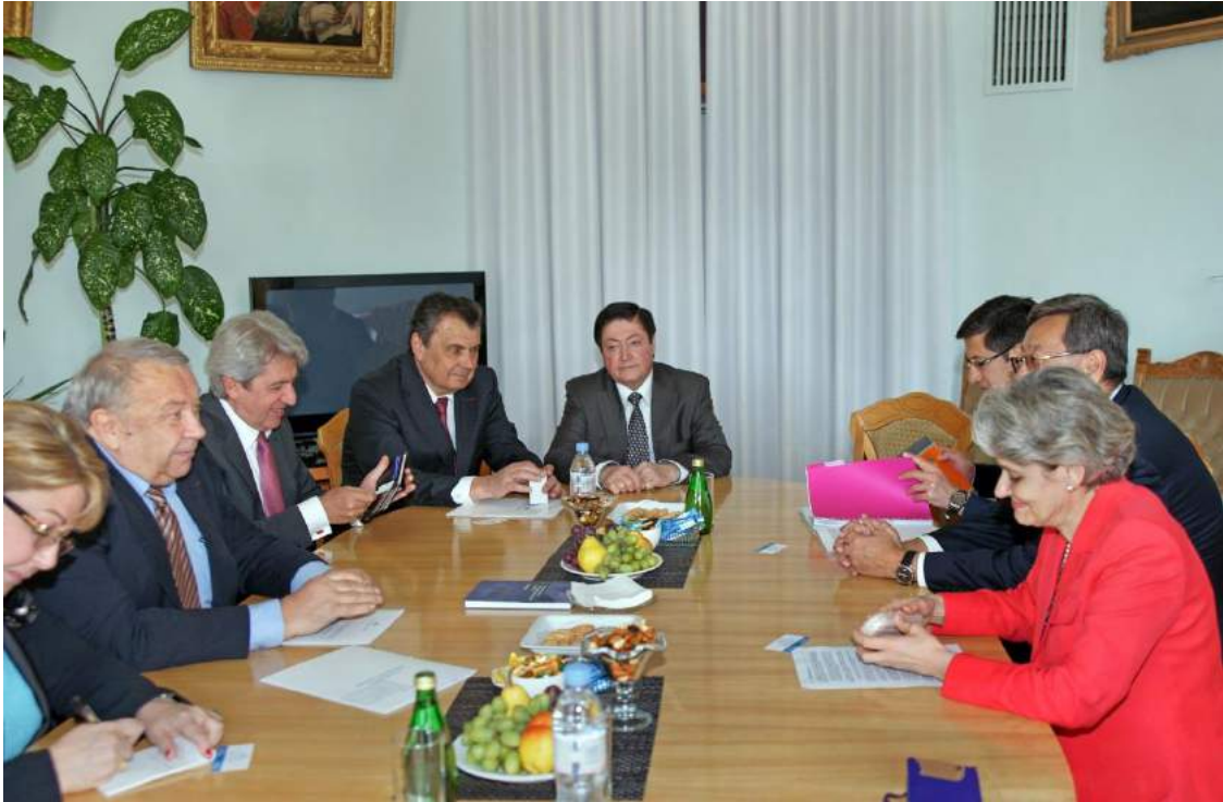
Meeting at the Russian Academy of Sciences.

In conversation the sides expressed mutual satisfaction with the high level of cooperation in science between UNESCO and the Russian Federation on issues separately stopped its further development, in particular, the idea of forming under the auspices of the international project management science.