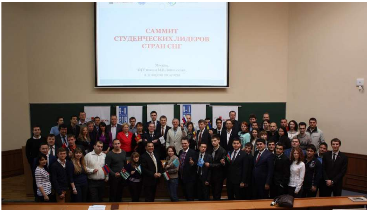
Summit of leaders of student and youth organizations.

Summit of leaders of student and youth organizations, conducted with the participation of UNESCO Chairs, has become a serious discussion platform for student and youth organizations from different countries in the context of work with young people as one of UNESCO's priorities.