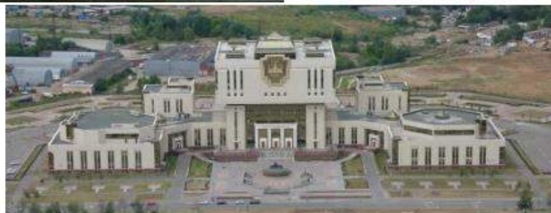
Platforms of Congress "Global Studies 2013"

Congress' Global Studies 2013 "was preceded with regular meeting of the International Consortium for Global Studies 18-23 June 2013 , bringing together more than 40 universities and research centers around the world, specializing in global and international studies.