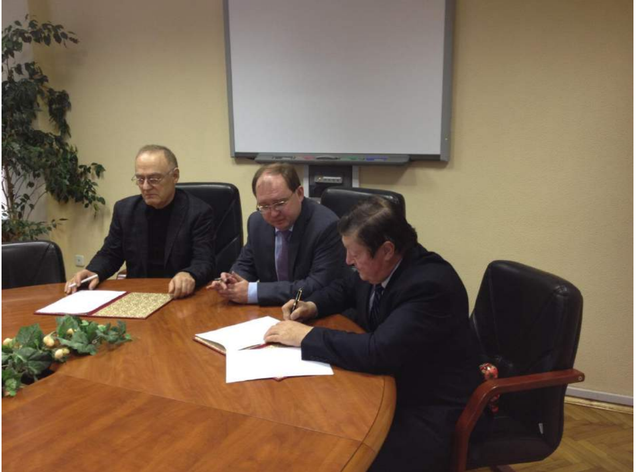
Signing the agreement on the establishment of the network section of the UNESCO Chair at Tbilisi State University named after I. Javakhishvili