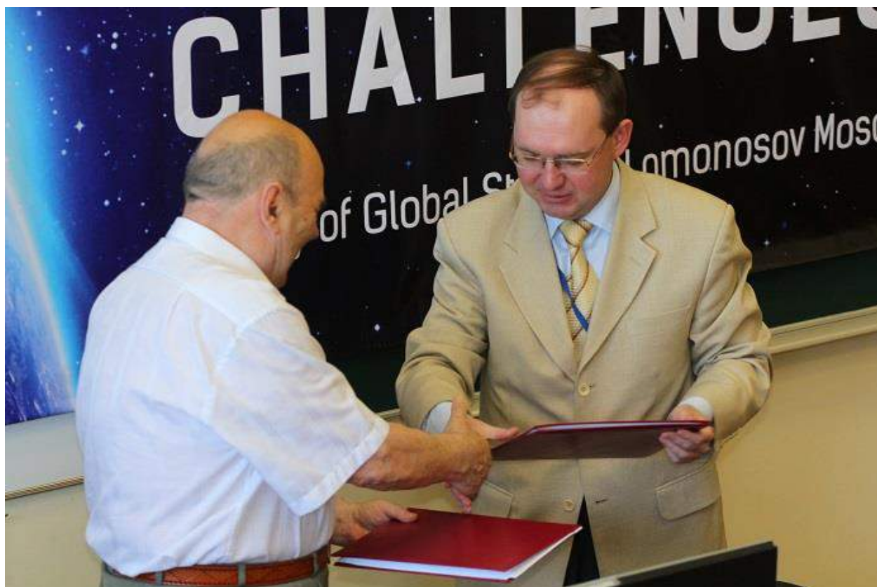
Ceremony at the Moscow Summit "New Global Challenges" presenting evidence to establish a branch of the UNESCO Chair on FGP MSU within the International Global Monitoring Aerospace (project IGMASS).