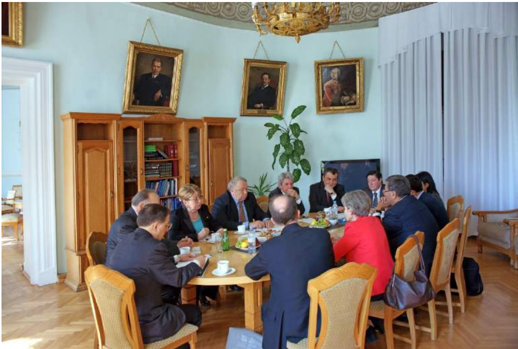
President of the Russian Academy of Sciences V. Fortov in discussions UNESCO Director-General Irina Bokova.

The sides discussed the possibility of resuming the project, based on the fact that the complex science, engineering, technology and innovation (THREADS) are increasingly determines the possibilities of socio-economic growth, quality of life and sustainable development, and to develop a global design management of science is one of the priorities of UNESCO.