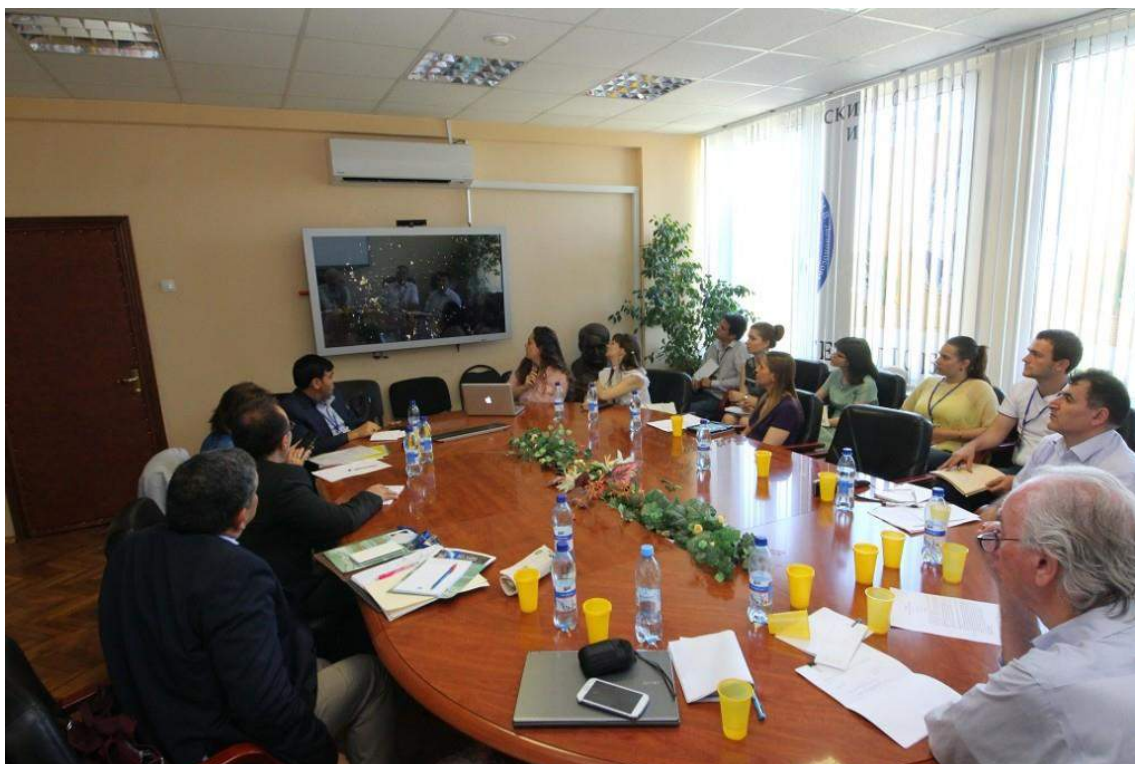
Discussion at the Moscow Summit "New Global Challenges"

Scientific educational events were organized at the Chair and the Faculty in the framework of the All-Russian School on Global Social and Natural Processes in Interdisciplinary Studies as a joint action with the MSU Youth Council on Federal Task Program aimed at the inclusion of young people in the scientific educational innovation processes in Russia. For this purpose special educational modules were elaborated in order to immerse the beginners into the theme.