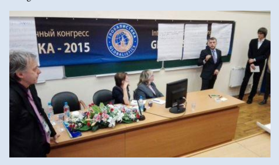
International School on «Management of Social Transformations» (MOST) held in Moscow October 28-30, 2015.

International UNESCO School on Management of Social Transformations (MOST) was held on October 28-30, 2015. UNESCO School in the framework of the UNESCO program «Management of Social Transformations» (MOST) held in Russia for the first time was dedicated to the «Diplomacy, Global Governance and the Post-2015 International Development Agenda».