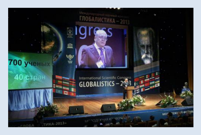
Plenary Session of the 4<sup>th</sup> International Scientific Congress «Globalistics-2015». Rector of the Lomonosov Moscow State University Acad. Viktor A. Sadovnichy

The Chair actively participated in the organizing and holding of the 4th International Scientific Congress «Globalistics-2015», October 25-30, 2015 dedicated to the 70-th anniversary of the UN and the UNESCO and the year of Russia's presidency in BRICS. The Congress included 7 sections, 4 conferences, 3 round tables, 3 master classes, 10<sup>th</sup> Civilization Forum on development goals. The Congress was attended by 984 participants representing 52 countries.